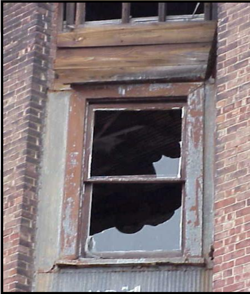
PLATE OR ANNEALED GLASS WILL BREAK IN LARGE SHARDS